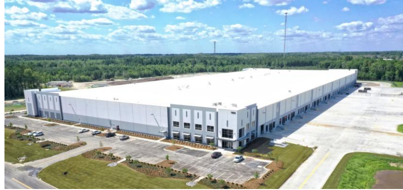
Building 1A – 420,650 SF

Delivered and Fully Leased June 2020 - Located Across the Parkway from 1C