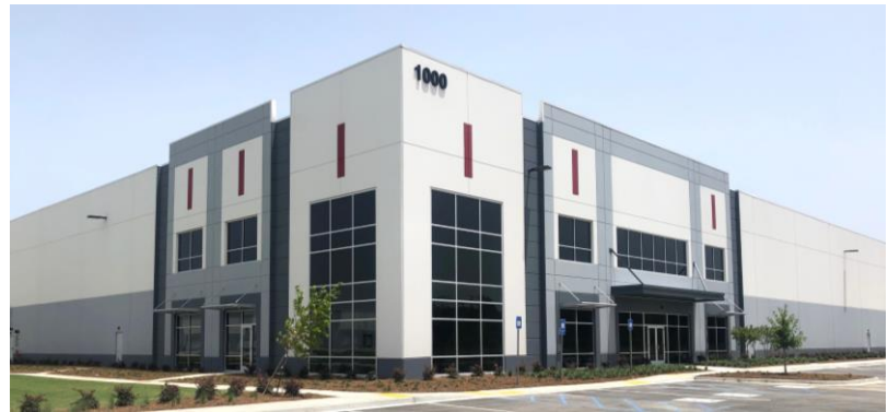
Building 1B – 154,550 SF

Delivered and Fully Leased June 2020 - Located Across the Parkway from 1C